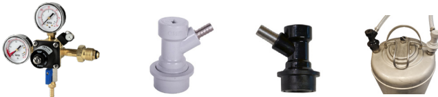
Nitrogen Regulator Gas Ball Lock Liquid Ball Lock

Kit includes primary nitrogen regulator, plumbing connections, and includes, two premix tank connections (gas and liquid).