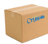
Included installation kit