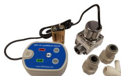
CR-LBS10JG Leak block sensor