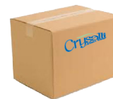
Included installation kit