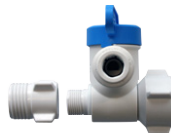
PASPP6 fitting Angle stop fittings