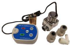
CR-LBS10JG Leak block sensor

The unit comes standard with a filter system built on and a water pressure reducer valve installed. Installation kit comes complete with a leak block sensor, hose and angle stop fittings.