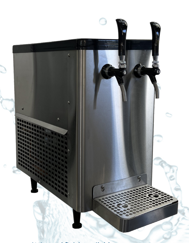
*Mirrored finish available upon request